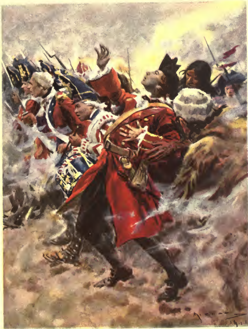
THE DEATH OF WOLFE

A shot struck Wolfe in the wrist . . . Again he was hit. Still he went on. Then a third shot struck his breast and he fell.